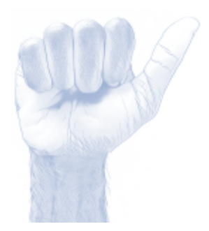
Full fist Bend fingers at knuckles and at finger joints as far as possible.