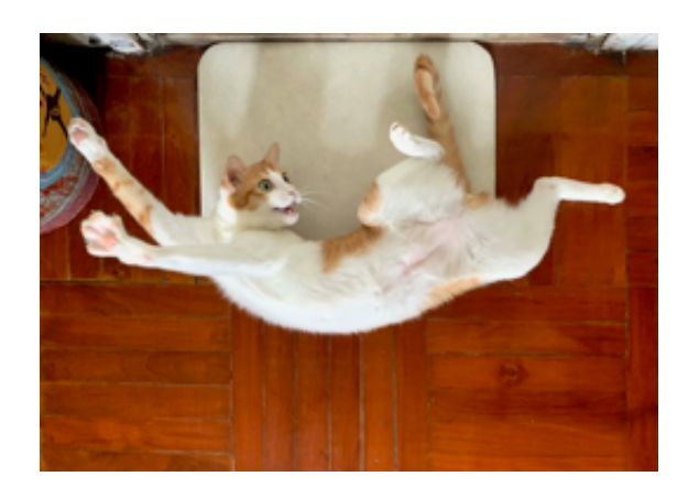
Smile - and the world smiles with you

Don't we all feel like doing this sometimes?