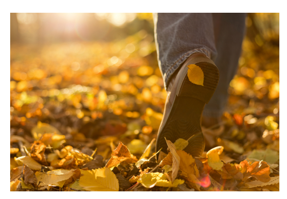
Feel the crunch of autumn With the colder weather fast approaching, it can be a little tough to stay motivated to exercise. But it's important to keep active all year round, so we've put together <u>some tips</u> to help you get out there, and brave the elements!

Looks like we're in for another bumper flu season - so it's important you know the facts and are clear about what you can do to protect yourself. To find out more, like who should be vaccinated and when, as well as information on COVID-19 vaccinations <u>check</u> out the latest Connective (t)ISSUES column.