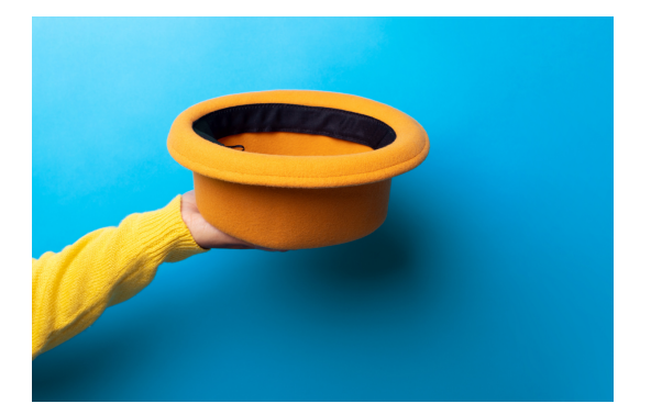
Tax time is almost here! Please <u>donate</u> today and help us provide essential services and support to those living with back apin and other musculoskeletal conditions.